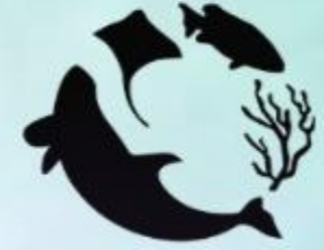
Destruction of Marine Ecosystem